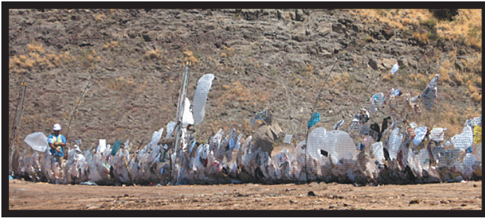
Helping to keep the beautiful island of Hawaii beautiful is 3000 ft of Defender at this landfill in Kapolei.