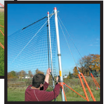
Final tightening of rope tensioners keeps the top high & straight.